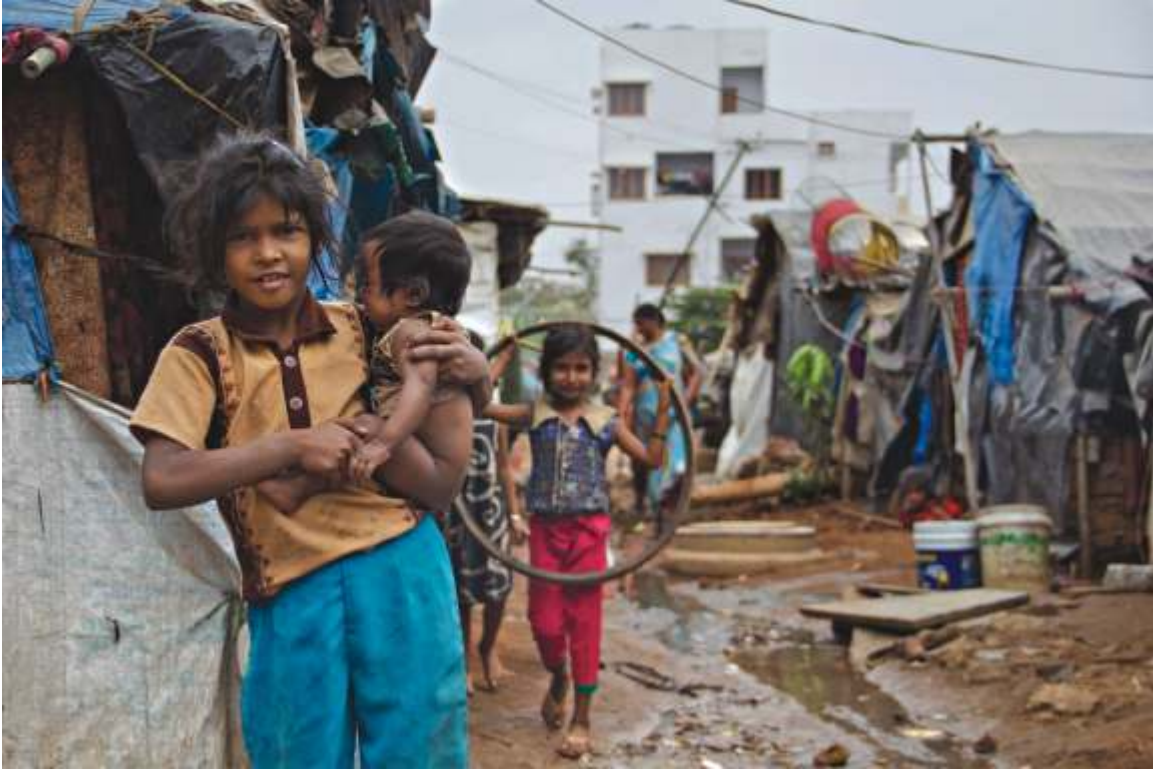
Young and taking care